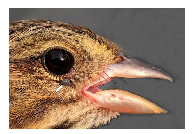
Figure 5. Song Sparrow, a juvenile, parasitized by three Ixodes scapularis nymphs (two are not visible). Since these ticks were acquired in close proximity to the nest, this bird parasitism indicates that an established population of I. scapularis is present within this nesting area.

During the nesting and fledgling period, ground-foraging passerines are short-distance disseminators of locally acquired ticks. In particular, juvenile (hatch-year) songbirds, which fly south for the winter, have not yet migrated. During this early summer period, a heavily infested juvenile songbird clearly shows that there is an established population of ticks within the nesting area (Figure 5).