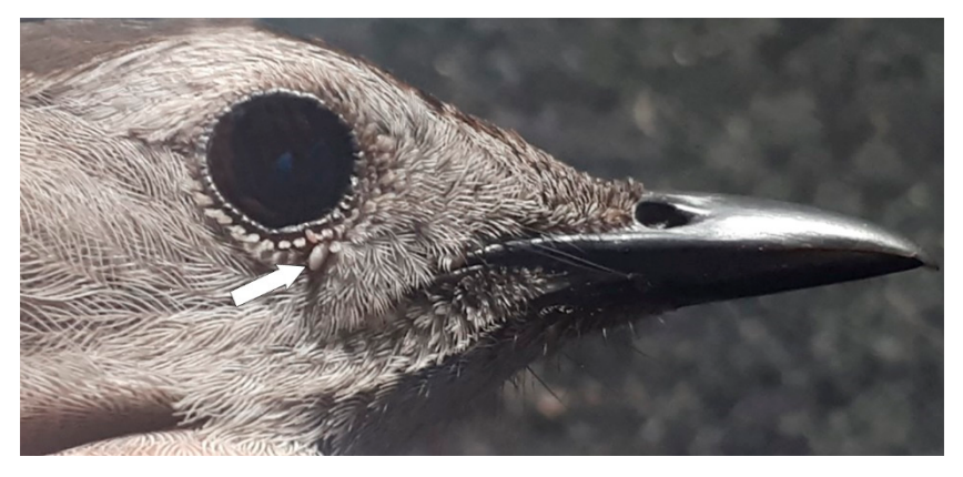
Figure 2. Gray Catbird parasitized by an I. scapularis nymph at Site 5. This nymph was infected with Babesia odocoilei . The white arrow points to the location of an engorged tick (the same below).

On 26 May 2018, a fully engorged I. scapularis nymph was collected from a Lincoln's Sparrow at Site 11; this nymph molted to a female in 39 days, and was infected with B. odocoilei . As well, two I. scapularis nymphs parasitized a Common Yellowthroat at Site 1 on 19 May 2018, and both of these nymphs were infected with Bbss (Table 3).