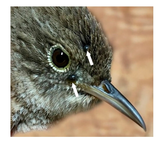
Figure 3. House Wren parasitized by Ixodes scapularis nymphs. While ground-dwelling passerines are foraging for morsels on the forest floor or meadow, they can be parasitized by bird-feeding ticks.

Other researchers have previously reported I. muris larvae parasitizing songbirds [17,21,22,28], but this is the first report of a Bbsl-infected I. muris larva parasitizing a bird. The presence of a Bbsl-positive I. muris larva parasitizing the House Wren suggests that this bird species has reservoir competency.