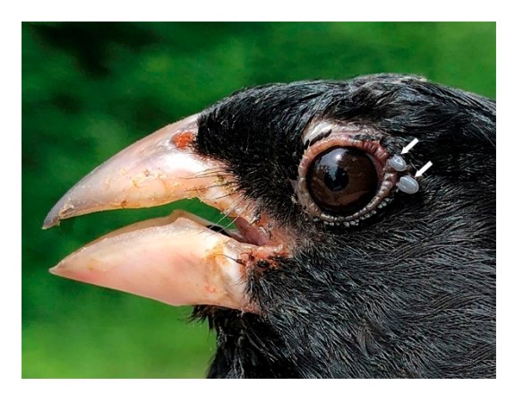
Figure 7. Rose-breasted Grosbeak, adult male, parasitized by Ixodes scapularis nymphs. Since this bird parasitism occurred during the nesting and fledgling period, these attached nymphs denote an established tick population in this locale.

A heavily infested songbird can initiate an established population of blacklegged ticks [32]. Whenever juvenile songbirds are infested with I. scapularis ticks, these tick collections clearly indicate that an established population is present. For example, ground-frequenting songbirds, such as the Rose-breasted Grosbeak, provide short-distance dispersal of ticks during the nesting and fledgling period (Figure 7).